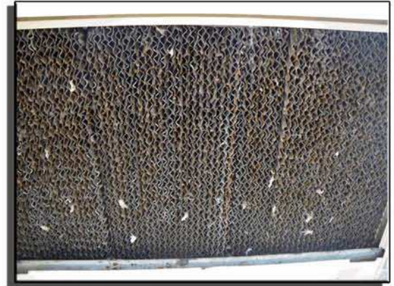
Cell Deck Without Cooler Guard

The problem of scale deposit build up is real. Time consuming clean up using acids and other harsh chemicals can be a hazard. But this can be prevented.